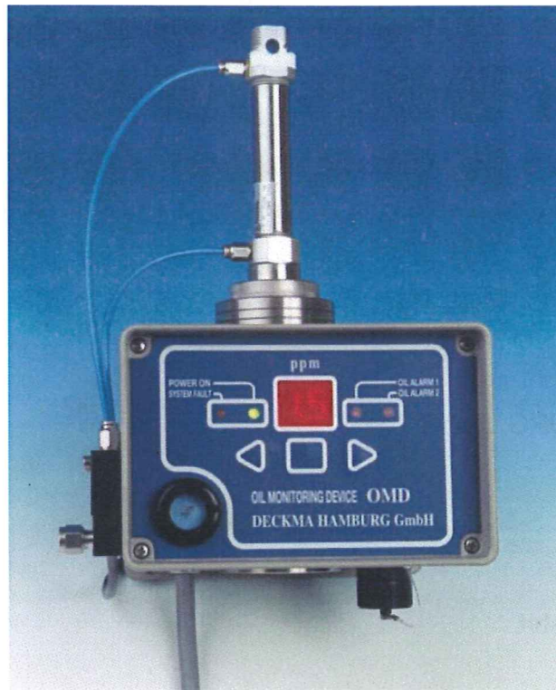
Model OMD-15A with Autoclean System

Continuous Monitoring of Oil-in-Condensate